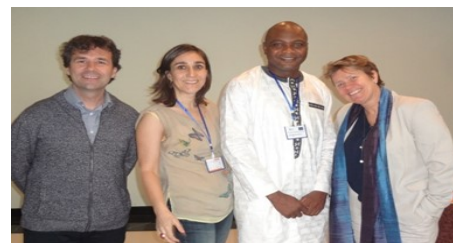
Global Support Facility (GSF) Team :

The GSF in coordination with EPHI/NIPN conducted this training workshop in which an ample experience from the GSF